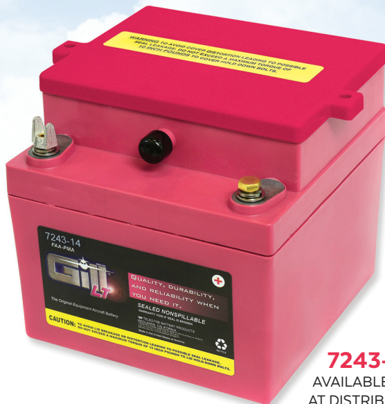
7243-14 AVAILABLE NOW, AT DISTRIBUTORS