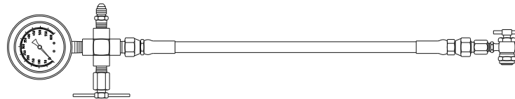
Model: 14-6900-6600 Air Strut Pressure Gauge