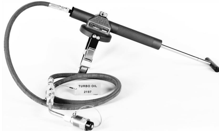
Model: 150-1 1 qt (.95 l) O-C Fluid Gun Dispenser