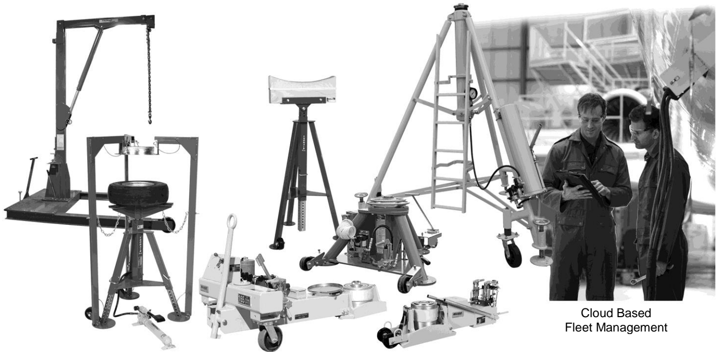
Cloud Based Fleet Management

The Tronair Family of Ground Support Equipment and cloud based EBis GSE Fleet Management